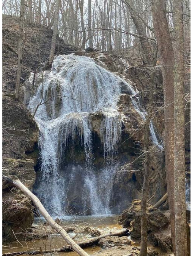
Falls Ridge in Winter

Much of Falls Ridge Preserve is a karst landscape, with travertine (a type of limestone) features, which is characterized by dissolved bedrock and sinkholes. In addition to the travertine waterfalls, there are caves in the preserve. Also located in the preserve are the