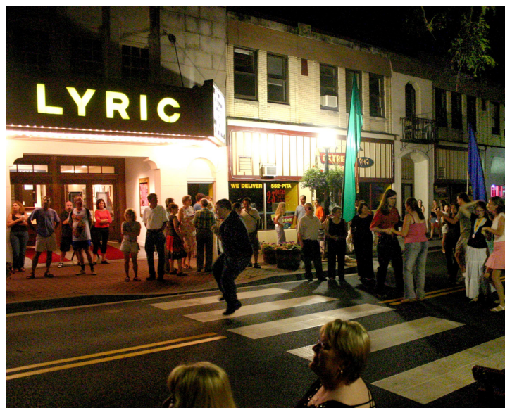
A street dance at the Lyric

Uncommonly Gifted, Main Street, downtown Blacksburg